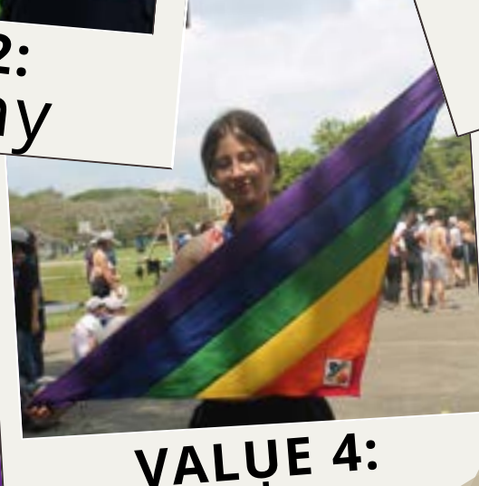
VALUE 4: Freedom