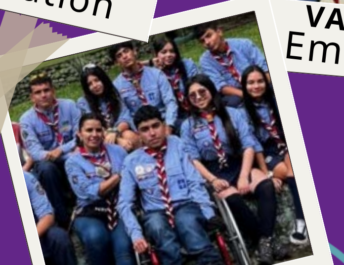
VALUE 5: Gratitude