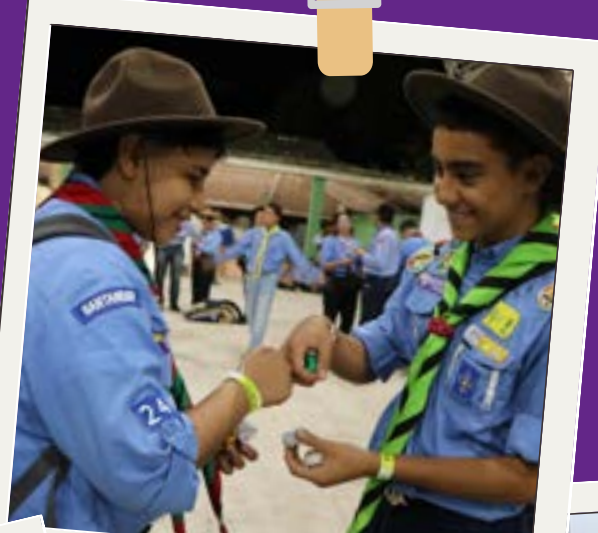
VALUE 2: Empathy