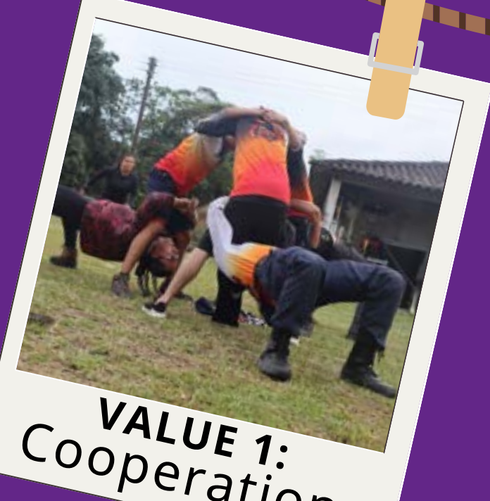
VALUE 1: Cooperation

Values to work on in the construction of Peace from the Program in the JamCam 2025